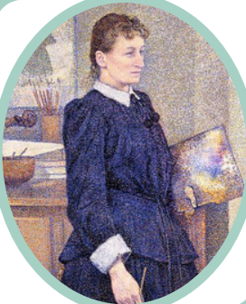
Anna Boch in her Atelier by Theo van Rysselberghe

She was a Belgian painter. She was the only female member of the artistic groupe Les XX.